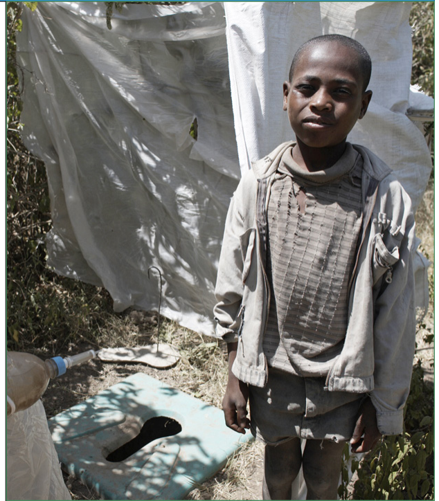
A boy stands beside his ArborLoo in Bedossa Betella, Ethiopia.