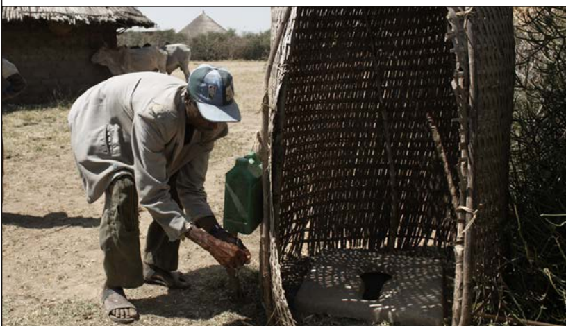
A man washes his hands after using his ArborLoo in Tuka Langano, Ethiopia.

In Ethiopia, local farmers have elected to make the pits smaller and use a toilet site for only about four months, so that they can speed up the planting of seedlings.