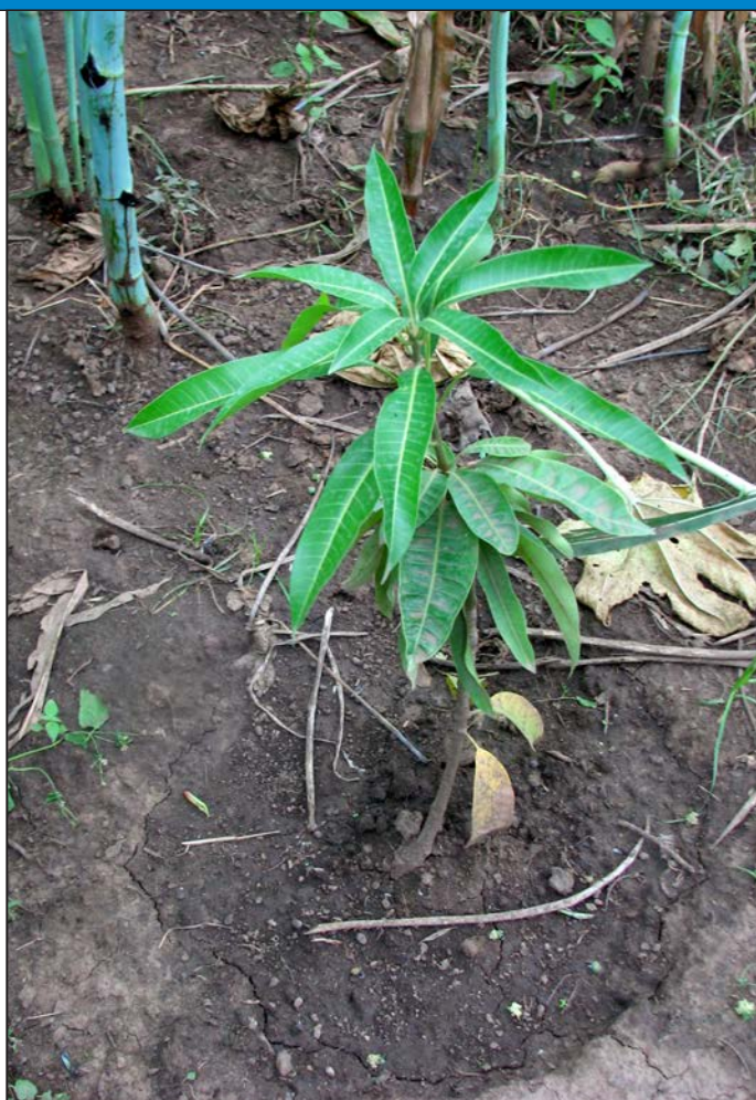
Young tree growing in an ArboLoo pit.

With a population of over 78 million, Ethiopia still counts many households in need of assistance. The Government of Ethiopia does not endorse subsidies for sanitation and therefore households must purchase slabs and pay other building costs. Many private artisans have been trained to make the small slabs for the ArborLoo, but materials are often hard to come by. Project partner organizations still have to assist in getting materials, and often have to cover